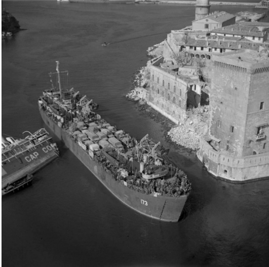
Allied ship loaded with vehicles and supplies entering Marseilles, France Harbour 1945 during Operation GOLDFLAKE