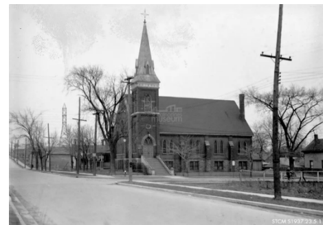
St. James Anglican Church, 1937. STCM S1937.23.5.1