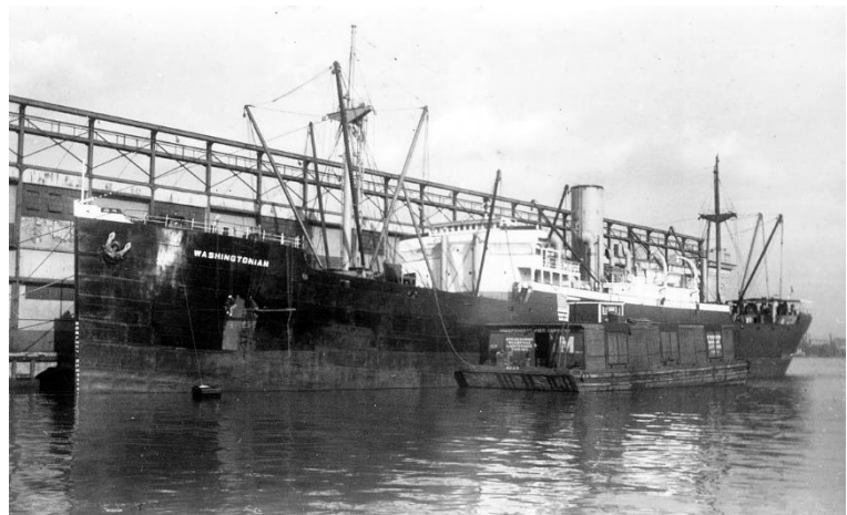
SS Washingtonian (formerly Eastern Mariner), sister vessel to R.J. Cullen steamship