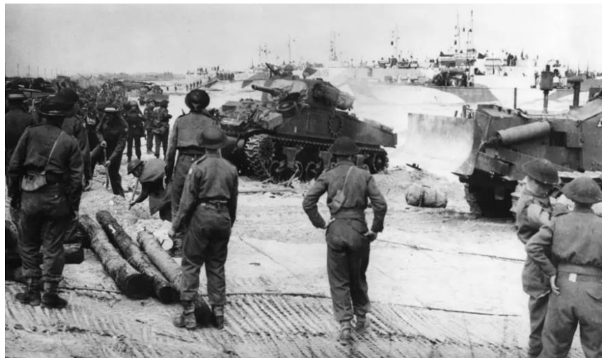
Troops from the Royal Winnipeg Rifles and Regina Rifles watch as tanks of the 1st Hussars land near Courseulles-sur-Mer, France, on D-Day in

6CAR suffered 38 casualties on D-Day and continued to support 3 rd Canadian Infantry Division as they moved inland against the Germans, facing stiff resistance when they were counterattacked. On 11 June 1944 the 1 st Hussars "B" Squadron was decimated during an abortive attack on the village of Le Mesnil Patry, northwest of Caen, France. 6CAR participated in the capture of Caen in July, followed by the Battle of Verrières Ridge. The Allies forced the Germans retreat from Normandy that summer.