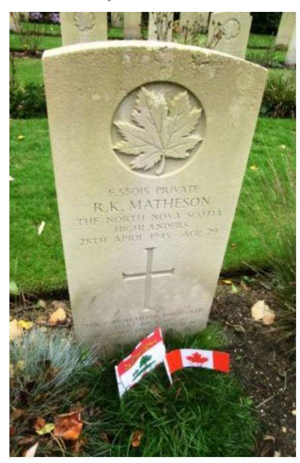
Grave of Ruel Kitchener Matheson at the Canadian War Cemetery in Holten.