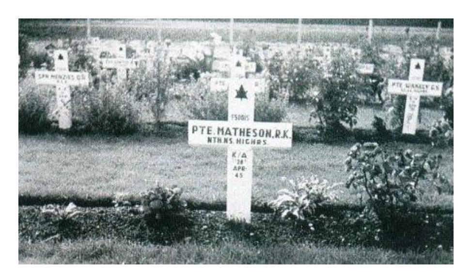
Temporary grave of Ruel Kitchener Matheson in Bingum, Germany.