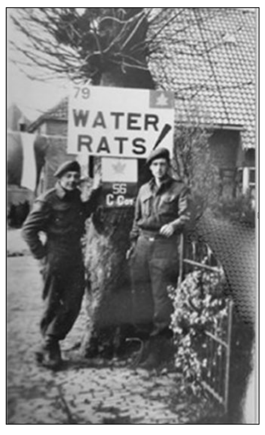
Victor A. Rawlings (right) (source:<u>wargraves.eu</u> / Information Centre Canadian War Cemetery Holten)

* 23 Nov 1916 (Victoria BC) † 9 Apr 1945 (Deventer, Netherlands)