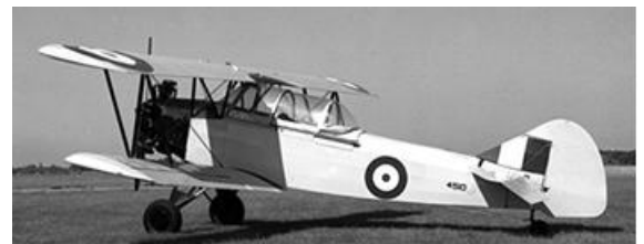
Fleet Finch 16B

In the 1940s, Fleet Aircraft in Fort Erie, Ontario, was a major Canadian manufacturer. They produced the Fleet Finch (Model 16B) as a primary training aircraft, of which more than 400 were delivered in 1941, and developed the Fleet 60K Fort (which first flew in 1940) as an intermediate training aircraft.