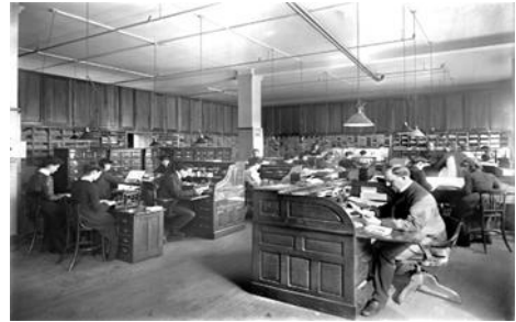
Office McKim Advertising

He worked in the office of A. McKim Advertising.