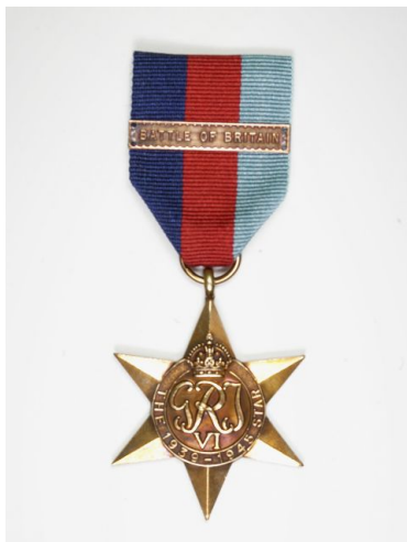
Pictured below, respectively.